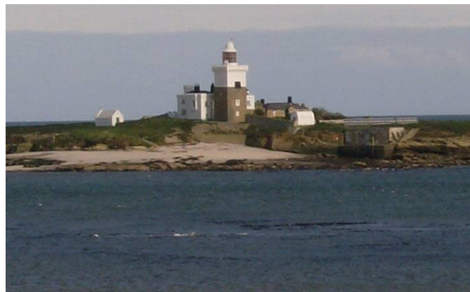
Figure 8.13 Coquet Island Lighthouse

The lighthouse (NH 5611, NU29300454) on Coquet Island was built in 1839-1841 incorporating the remains of a C15 tower which adjoined the medieval monastic cell. This influenced the shape of the lighthouse which is a square tower standing 21.9m high with a crenelated parapet. It is a Grade II* Listed Building.