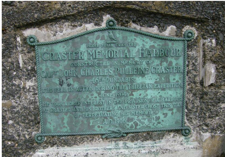
Figure 8.11 The memorial plaque at Craster Harbour

to Capt. John Craster who was killed during the 1904 Younghusband expedition to Tibet.