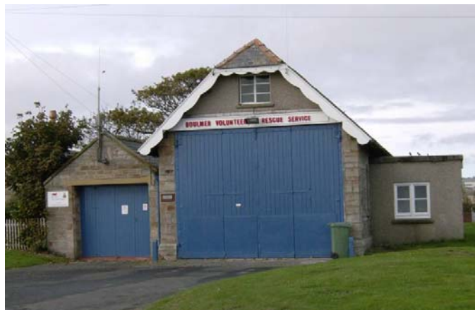
Figure 8.15 Boulmer Volunteer Rescue Service building

The HER records a lifeboat house at Cambois (NZ31198281, NH 18303) and a lifeboat station at Huxley (NU28580281, NH 20354). The Alnmouth Lifeboat Station consists of a pair of stone-built mid C19 buildings (NU25091075, NH 14178). They are both Grade II Listed Buildings.