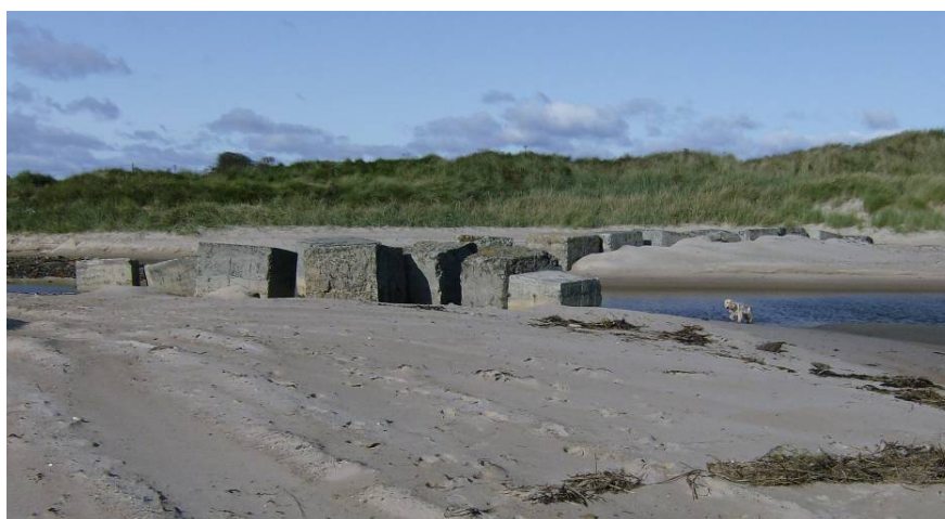
Figure 8.19 Anti-tank blocks in the Druridge Bay Defence Area (author)

The foreshore was protected by a continuous line of anti-tank blocks set within and at the foot of the dunes while to the rear of the dunes was a continuous anti-tank ditch. The blocks can be found almost anywhere while a section of anti-tank ditch survives to the north of Druridge Farm.