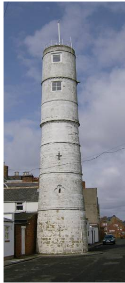
Figure 8.14 The High Light at Blyth

modern navigational aids. The High Light is a Grade II Listed Building.