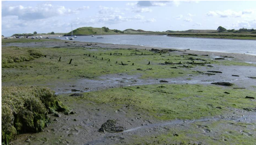
Figure 8.9 Oyster beds at Alnmouth

The area is being actively eroded by the river and the SMP1 data show the whole area to be at risk of flooding. It lies in SMP1 Unit 28 for which The 'Preferred Strategic Option' is 'Selectively hold the line'. It will be necessary to reconsider the situation once the SMP2 data become available.