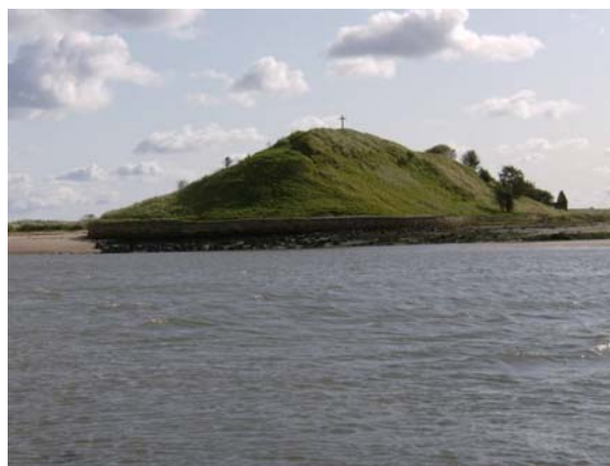
Figure 8.1 The site of St Waleric's Church, Alnmouth (author)

Coquet Island lies about 2km to the east of Amble Harbour. It measures 0.35km N-S and 0.15km E-W but is over twice this extent at LAT. It slopes gently W-E from 10m OD to 2m OD. The geology of the island is Coal Measures sandstones capped by boulder clay on which has formed a loam soil.