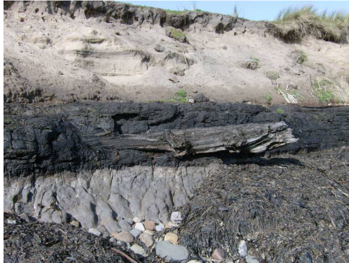
Figure 8.2 Peat and fallen tree trunk overlying boulder clay at Low Hauxley

the case of Cairn 2. The implication of this is that the dunes either began to form or reached their present position during the early 2 nd millennium cal BC. The importance of this situation cannot be overstressed. For a zone of about 8km the dunes at the head of Druridge Bay seal a land surface that was the focus of human activity from the 6 th to early 2 nd millennium cal BC and the potential for making significant discoveries is considerable but one seriously threatened by coastal erosion.