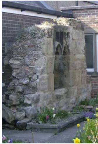
Figure 8.6 Fragment of the Amble monastic grange (author)