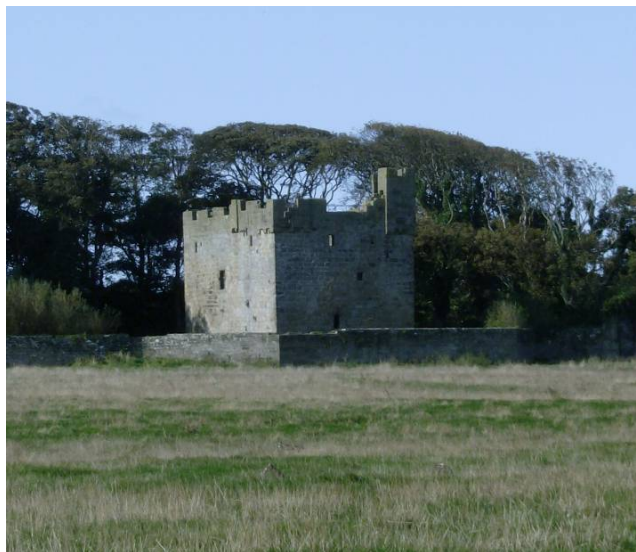
Figure 8.4 Creswell Tower (author)

Lesser fortifications are represented by three tower houses . The most southerly is the C15 tower at Creswell (NZ29369335, NH 11924). It is a rectangular structure measuring 12.5m by 8.5m. It consists of two floor levels over a vaulted basement while the present parapet and turret are probably C18 additions. It is roofless but otherwise well preserved. An C18 house formerly adjoined the tower on the north but this was demolished in the mid C19. The Creswell Tower is both a Scheduled Ancient Monument and a Grade II* Listed Building.