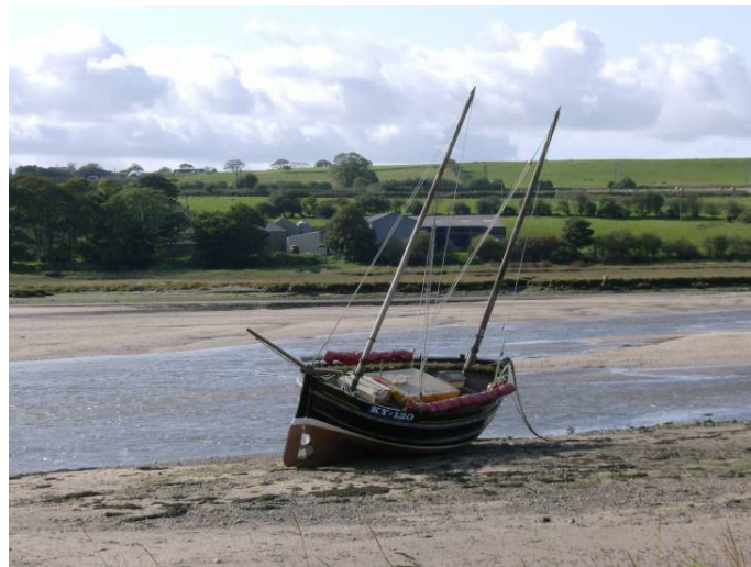
Figure 8.10 A vessel 'taking the ground' in Alnmouth Harbour

The estuary of the River Aln at Alnmouth was an important grain exporting port in the C16, C17 and C18. It lay at the far end of the 'Almouth Road' which ran from Hexham and through Rothbury. The grain trade at Alnmouth is evidenced by many fine stone built granneries which line Northumberland Street but the port never developed any formal harbour works, vessels simply either anchored in the river or took the ground at low tide.