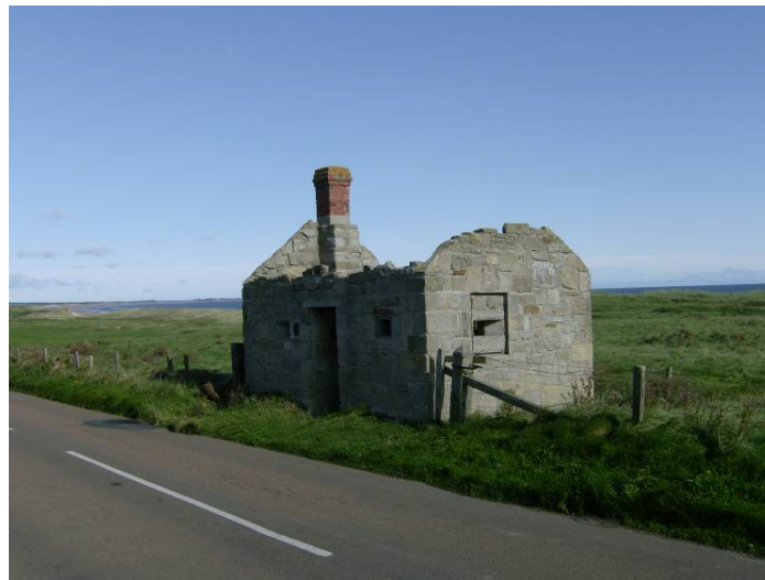
Figure 8.18 Pillbox S0007011 Druridge Bay Defence Area

In addition to pillboxes, Foot's study has also recorded a number of gun emplacements which fall into the category of beach defence batteries .