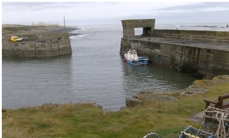
Figure 8.12 Craster Harbour (author)

The harbour works consist of a concrete North Pier extending 64m to the SE and a concrete South Pier which runs for 60m NE and then a further 70m due north towards the North Pier, leaving an entrance about 45m wide. At low tide the harbour dries out. The harbour was constructed mainly for the shipment of whinstone from the nearby quarries, though it also served the fishermen who had used the haven for centuries.