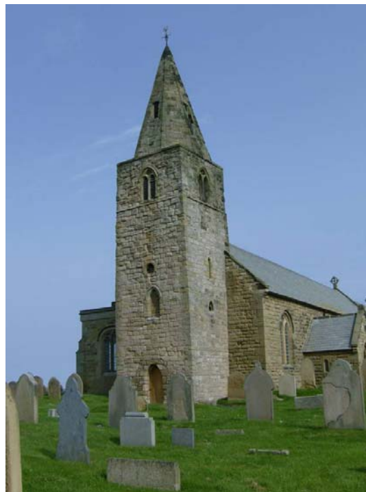
Figure 8.7 St Bartholomew's Church, Newbiggin (author)

Although Blyth and Amble had medieval antecedents, these settlements amounted to no more than small fishing villages, the main centres of population on this section of the coast being the new towns of Newbiggin, Warkworth and Alnmouth. All that remains of medieval Newbiggin is St Bartholomew's Church and the putative traces of a hospital (referred to above). Only part of the failed Norman borough of Warkworth lies within the NERCZA study area. HER entries include the C14 bridge (NH 5411), the medieval gateway