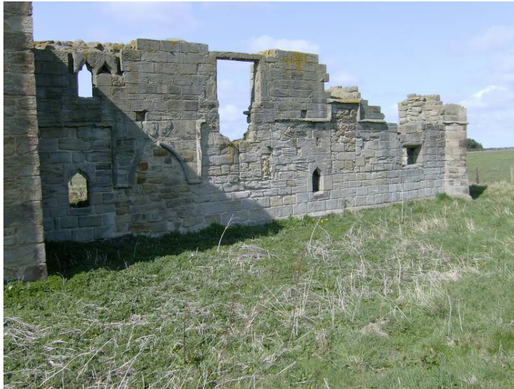
Figure 8.5 Low Chibburn C14 Preceptory (author)

As mentioned in the previous section, there is documentary evidence that St Waleric's Church at Alnmouth was not the first church on that site and that when William de Vescy established the new town at Alnmouth it was only necessary to enlarge an existing building, though in effect this appears to have been a virtual rebuilding. This is recorded as taking place between 1170 and 1190. Few details survive as the church was destroyed during the storm of 1806 which altered the course of the river and cut St Waleric's off from the rest of the town, though C18 engravings show that it was already ruinous by then. These engravings, which have been studied in detail by Bettess and Bettess (2004, 60-64), indicate a large building consisting of a nave, transepts and chancel. Nothing now survives above ground level and some of the site has been lost to erosion.