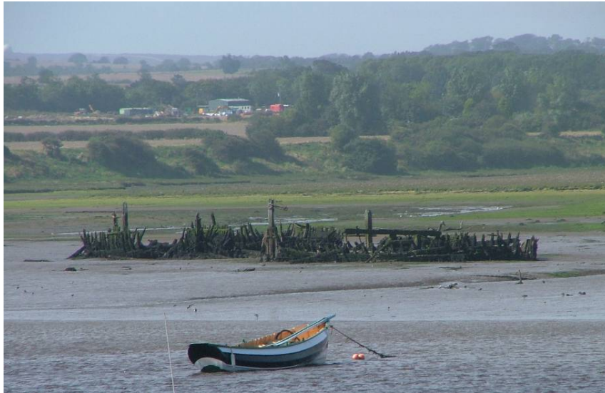
Figure 8.16 Wooden hulks on the north shore at Amble Harbour

The Amble hulks lie within SMP1 Unit 30 for which The 'Preferred Strategic Option' is 'Selectively hold the line'. It will be necessary to reconsider the situation once the SMP2 data become available but it is unlikely resources will be made available to protect these remains from the effects of rising sea level. A full survey should be considered an urgent priority.