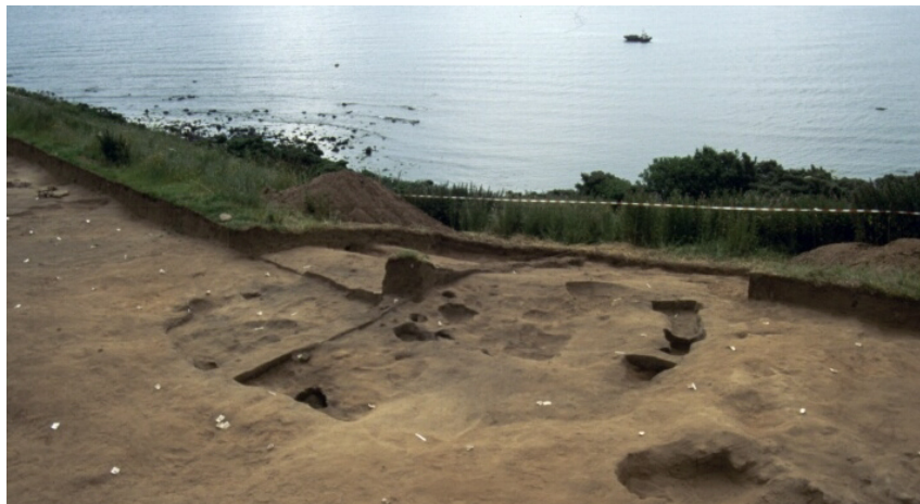
Figure 8.8 Site of the Mesolithic hut at Howick Burn (ARS)

The fieldwalking programme at Howick led to the discovery of the Howick Burn occupation site (NU25851660, NH 5690). As well as an assemblage of 18,000 stone tools the excavation of this site uncovered the remains of a circular Mesolithic hut. This was partly sunk into the ground and although some of the structure had already been lost to erosion it was established to be about 6m in diameter. On the basis of radiocarbon dates obtained from successive hearth features, the construction of the hut has been dated to circa 7800 cal BC, which makes it the earliest dated evidence for human settlement in Northumberland. As well as stone tools, finds included charred animal bones and hazel nut shells and occasional marine shells, though the site should not be regarded as a midden . SLI and RSL data discussed in Chapter 3 indicate that at the time the Howick hut was occupied LAT was displaced horizontally by about 200m. This is unlikely to imply a wider foreshore as the cliff face can be expected to have lain farther east by an equivalent amount.